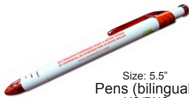
Size: 5.5" Pens (bilingual) YC/PNC

5.5" long. Eco-friendly, click-action ballpoint pen made of plastic that biodegrades in 18-60 months in a regular landfill. Imprinted with two phrases "Co-operative enterprises build a better world" and "Les coopératives, des entreprises pour un monde meilleur".