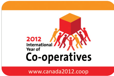
Size: 2"x 3" with rounded corners Magnets YC/MAG

2" x 3" with rounded corners. 0.02" thick with a glossy lamination.